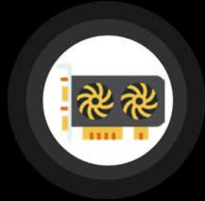
MULTI GPU SERVER